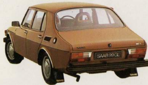
SAAB 99GL (4 DOOR)