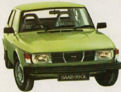
SAAB 99GL (2 DOOR)