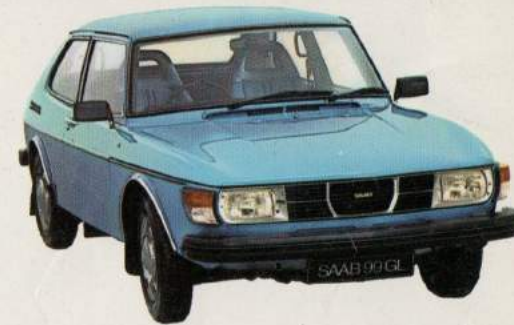
SAAB 99GL COMBI COUPÉ