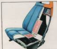
Electrically Heated Driver's Seat. It works like an electric blanket to keep you warm on cold mornings.