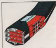
Impact-Absorbing Bumpers. They protect the car. And since they return to their normal shape, they protect themselves as well.