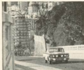
A Falcon storms uphill on the twisting Grand Prix circuit in Monte Carlo.