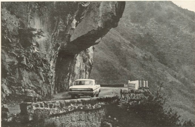
Maritime Alps were full of empty voids like this "shelf" turn at the start of the fourth special section. There is no margin for error.

Falcon entered two classes in Europe's 2,700-mile winter ordeal, won them both...and finished second overall out of 299 cars. That's durability!