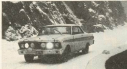
Snow was a lot surer footing than the ever-present glare ice. Here practice run tests Falcon traction.